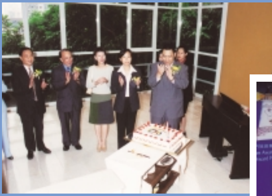
六週年校慶活動『認識澳門旅遊業工作坊』頒獎典禮 Activity for celebrating the 6th Anniversary of IFT : "Tourism Awareness Campaign" (TAC) Award Presentation