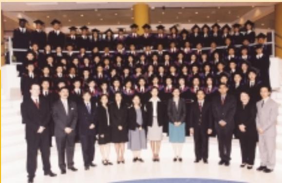
旅遊高等學校畢業典禮 Graduation Ceremony of the Tourism College of Macao