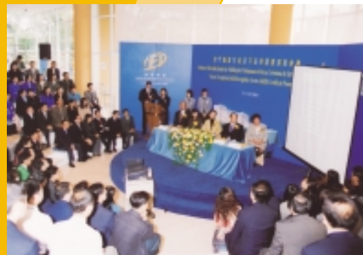
『澳門職業技能認可基準』證書頒發典禮 "Macao Occupational skills Recognition System" (MORS) Certificate Presentation