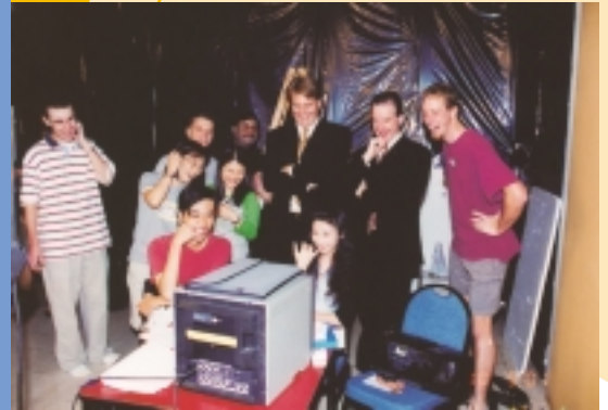
拍攝旅遊學院音樂短片 Production of IFT Music Video