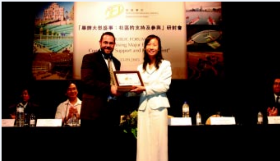
Organised a Public Forum on “Organising Major Events: Community Support and Involvement”