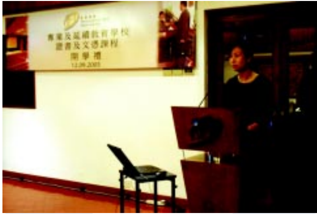
Student Orientation, Professional And Continuing Education School