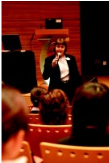
Disney World, USA organised a Recruitment Seminar at IFT