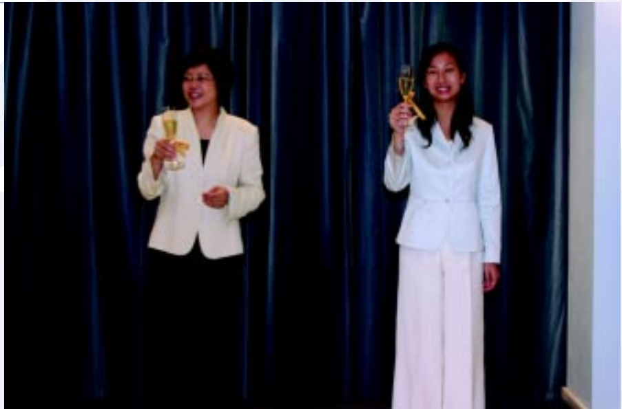
Celebrated the 10 th Anniversary of IFT