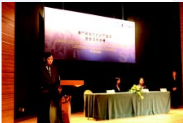
MORS Certificate Presentation Ceremony