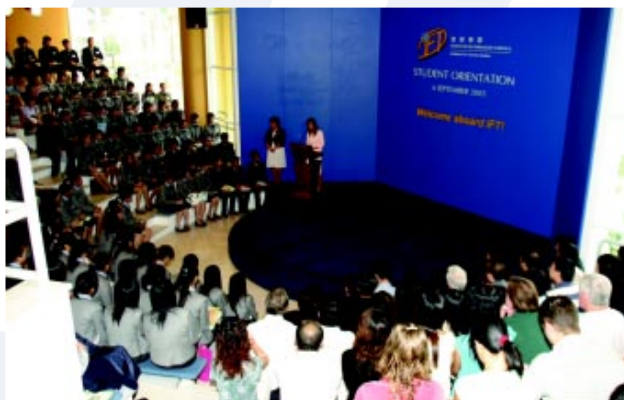
Student Orientation, Tourism College of Macao